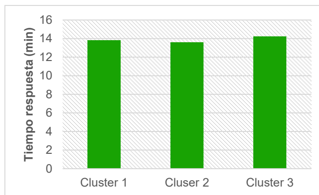
Fig 3. Cluster Response Time.

The K-Means clustering analysis identified three main clusters with distinct characteristics (Figure 3).